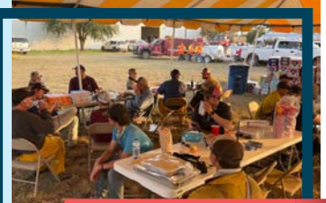
Volunteer fire crews taking a needed break during the Mesquite Heat fire

CFA has been managing fire relief funds to serve victims and fire departments. We are honored to serve as the region's trusted source to quickly and effectively collect and distribute donations when an unplanned event causes widespread destruction.