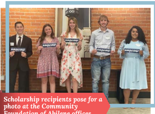
Scholarship recipients pose for a photo at the Community Foundation of Abilene offices.

See the full list of scholarship recipients at cfabilene.org/2022-scholarship-recipients .