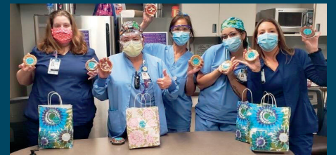
$300k - We delivered 400 mini pies to nurses at Abilene's two hospitals, thanking them for their service.